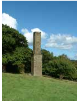
Goitstock Mill Chimney